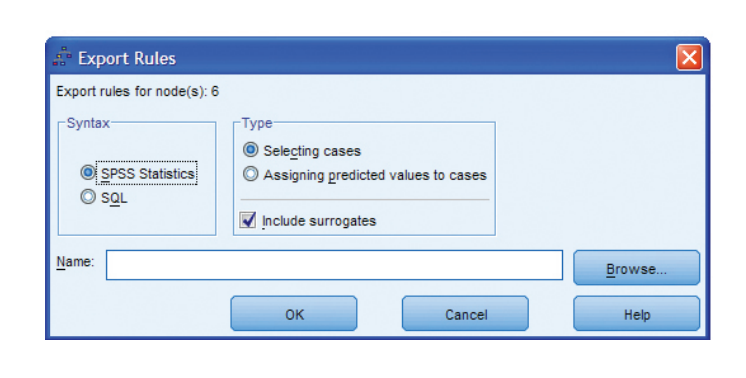
Figure \ 4: Directly select cases or assign predictions in your data from the model results, or export rules for later use.

Figure 3 : Create tree models in SPSS Statistics using CHAID, Exhaustive CHAID, C&RT or QUEST.